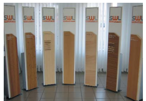
Above: SWL can offer an extensive range of substrates and veneers.

Investment in product and plant has enabled SWL to offer high quality panels and boards